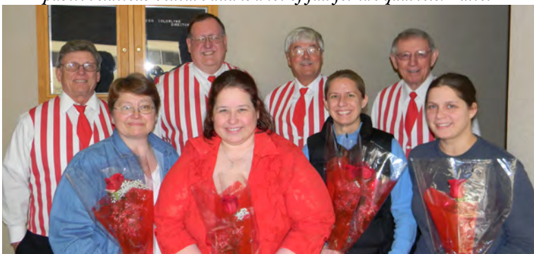
RFD sings to the Offices Workers