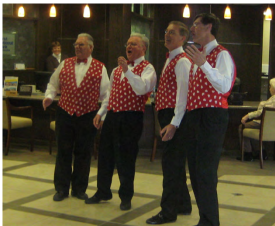
Magic performing at the 1st. National Bank in St. Peter