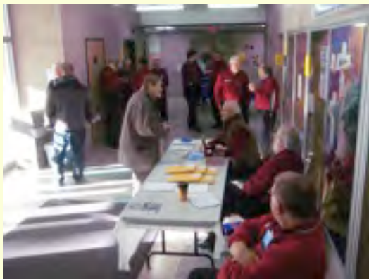
"Manning the Registration Desk at Fitzgerald Middle School"

Soul Purpose - Southwest Division Novice Quartet Champion