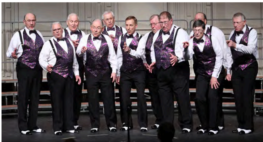
2011 SOUTHWEST DIVISION CONTEST VLQ CHAMPIONS - “RIVERBLENDEERS”