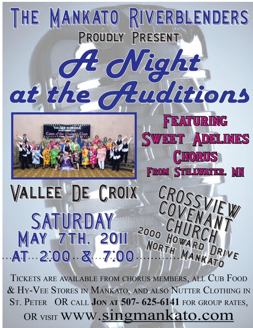
2011 ANNUAL SHOW POSTER