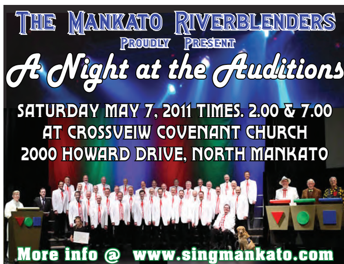
2011 ANNUAL SHOW POSTCARD