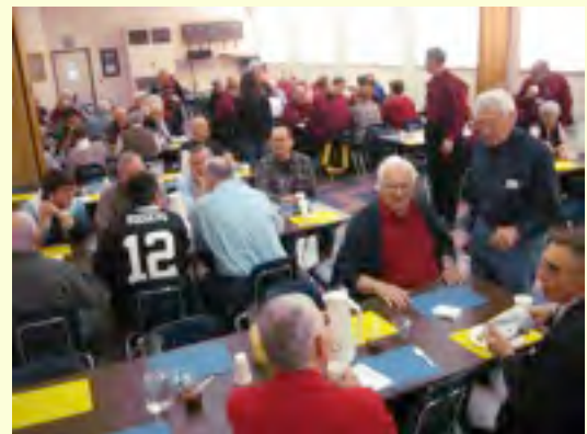
"Having a little lunch at Fitzgerald Middle School"