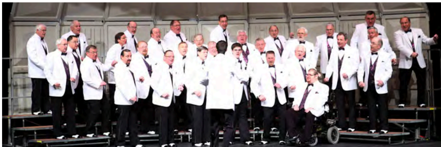
2011 SOUTHWEST DIVISION CONTEST CHORUS CHAMPIONS - “RIVERBLENDEERS” 2011 SOUTHWEST DIVISION CONTEST PLATEAU AA CHAMPIONS - “RIVERBLENDEERS”