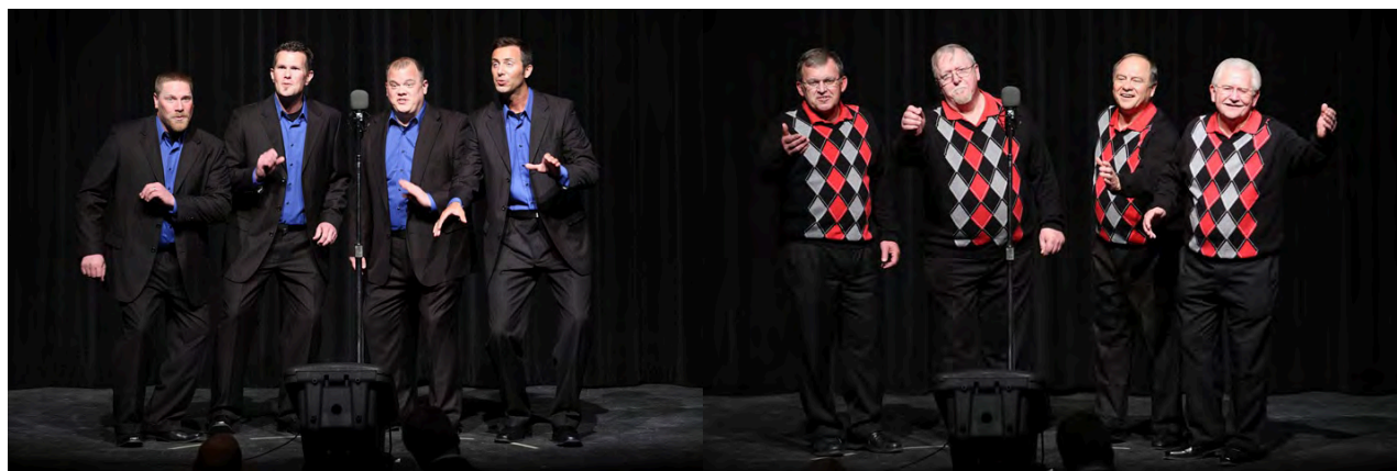
2011 SOUTHWEST DIVISION CONTEST QUARTET CHAMPIONS - GRAND DESIGN