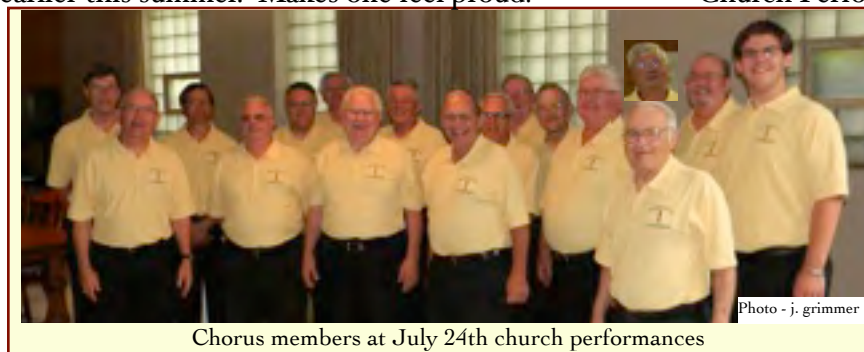
Chorus members at July 24th church performances