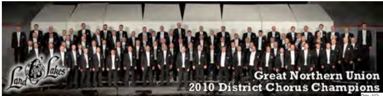
2nd Place Silver Medals - Hilltop, MN - Great Northern Union Chorus