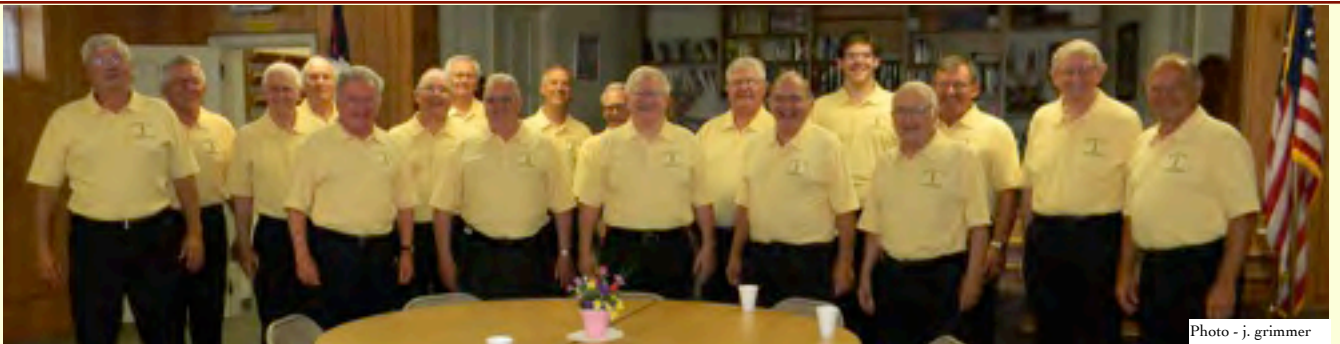
Chorus members at July 17th church performances

The Choir Director, at one of the churches, was grateful for one of the songs we sang. It was not a song the members of her church would ordinarily hear, due to music restrictions in their church.