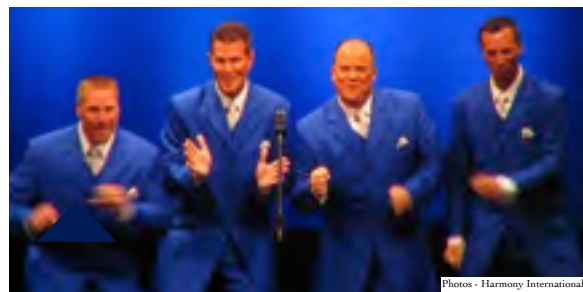
GRAND DESIGN" on the contest stage in Kansas City