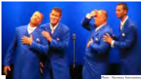
45th Place - Grand Design Mankato/Hilltop/St. Croix Valley