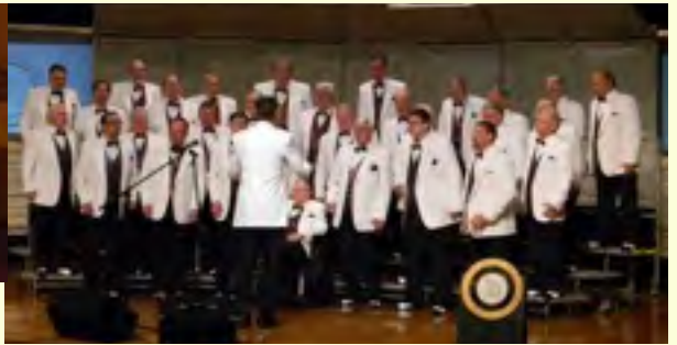
Second Half - Chorus in their uniforms