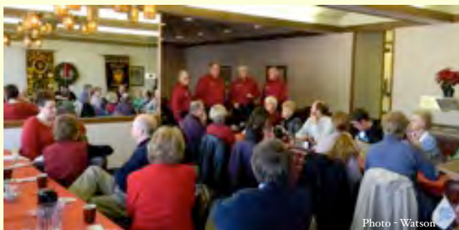
RFD performing at the annual Sertoma Christmas Party