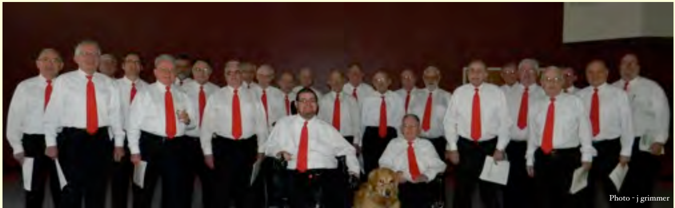
The 28 members that sang for the "Hilltopers" at Christ The King Church in Mankato. We had a great time and sang for a great audience. They then served us a huge lunch!