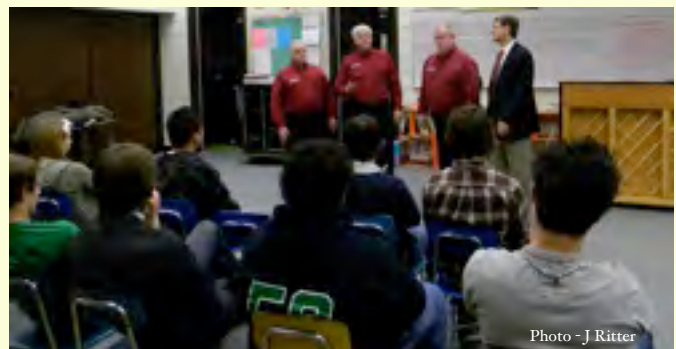
Pick Up Quartet Performing at Waterville High School