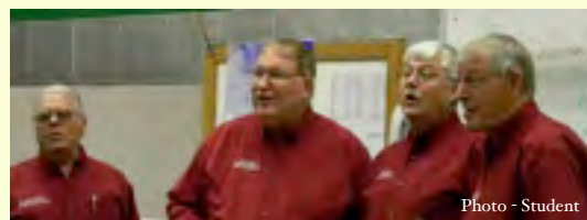
RFD Performing at Mapleton High School