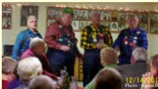
RFD performing at the annual Wells Lions Christmas Party