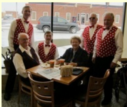
MAGIC - Singing Valentines