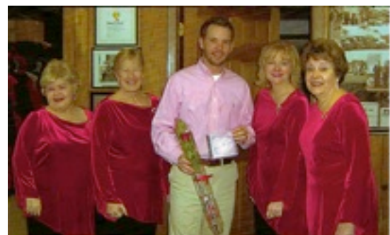
Besides singing, the Sweet Adelines offer their Valentine-gram recipients a rose, a hand-crafted card (created by one of the group members), a picture and sometimes a bonus CD with tracks of the group's barbershop-style songs

terparts, also deliver these romantic musical messages.