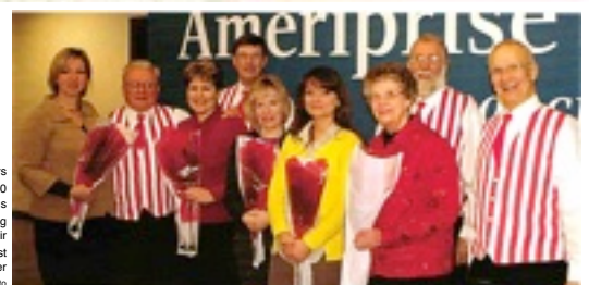
The Riverblenders perform about 8-130 Valentine-grams every year, making the songs their second-biggest fundraiser submitted photo

Readers can purchase singing Valentines from the Riverblenders by calling 507-934-2371 or from the Sweet Adelines by calling 507-368-6148.