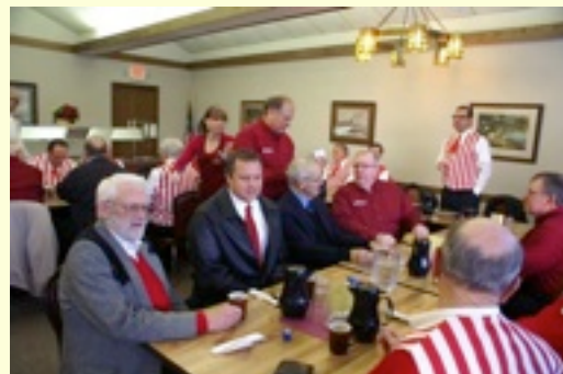
Breakfast Meeting and Warm up at Happy Chef North