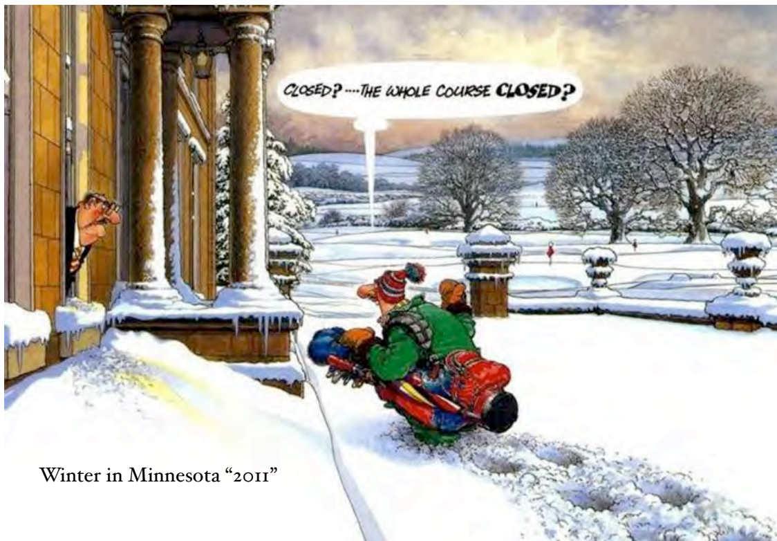
Winter in Minnesota "2011"