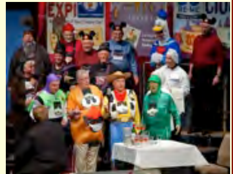
Soul Purpose sings their 1st song