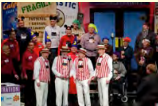
Riverbend singing their 1st song