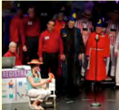
Actress: Emily Norell