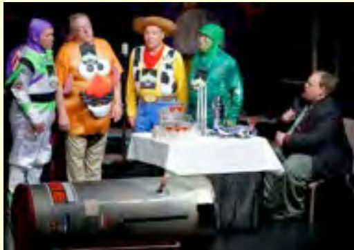
Soul Purpose & Matt