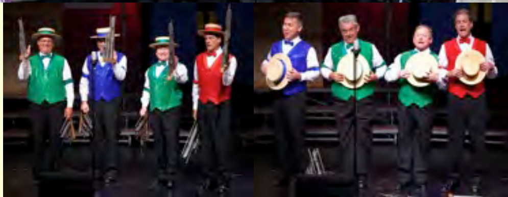
More of the chorus and quartets. The Second Half of the Show - Riverblenders Chorus in their Tuxes and the fabulous “Humdinger’s” from Florida!