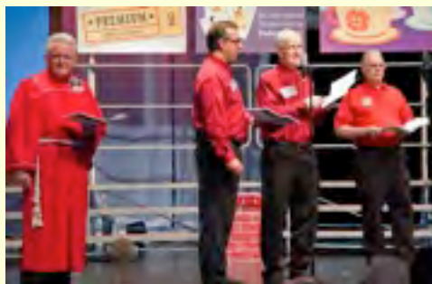
Intermission Sing Along