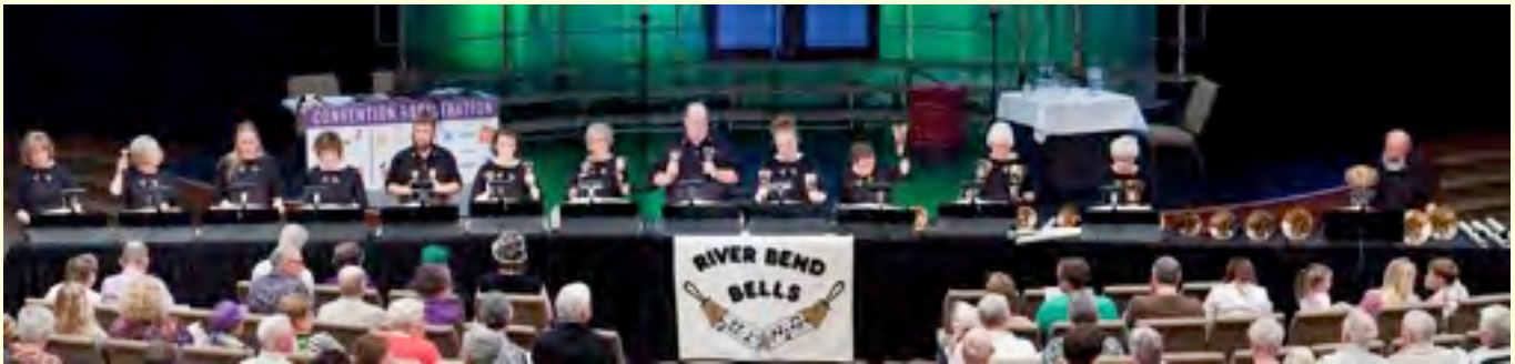
The show opened to a great audience with the renowned "River Bend Bells" bell choir