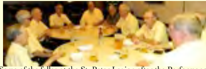
Some of the fellas at the St. Peter Legion after the Performance