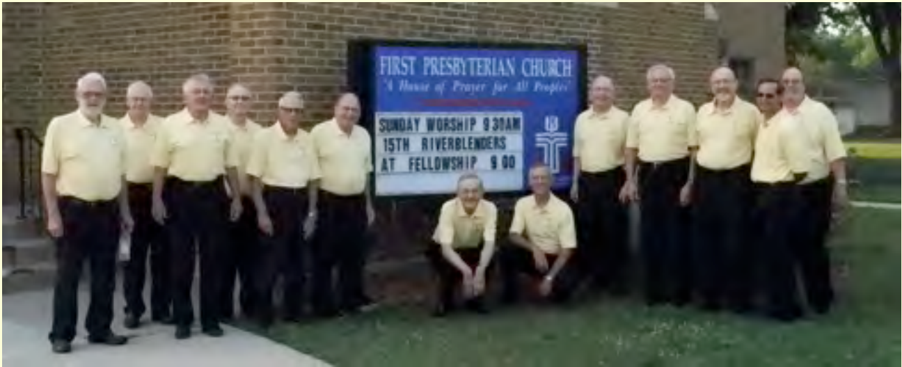
July 15th performers pose for a picture in front of the First Presbyterian Church Sing (read sign)

Thanks go out to Joel Botten and the rest of the guys that lined up the vast amount of churches and retirement centers that we sang at this July.