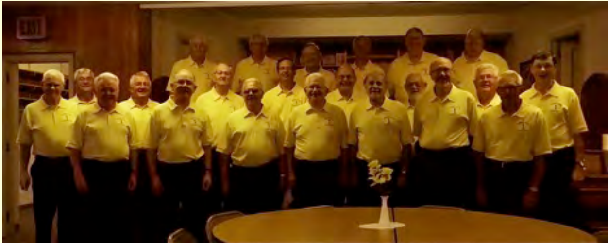
July 15th performers pose for a picture warming up in the First Presbyterian Church

Thanks to a great group of singers and great people to sing for.