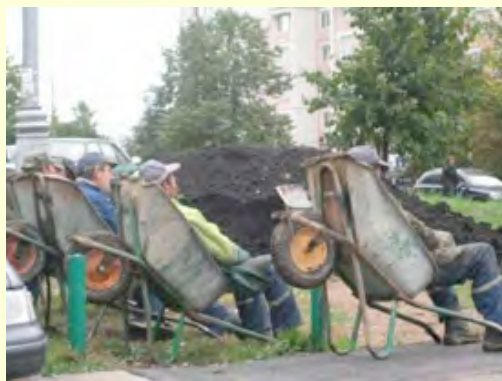
The best use of a wheel barrow that I have ever seen!