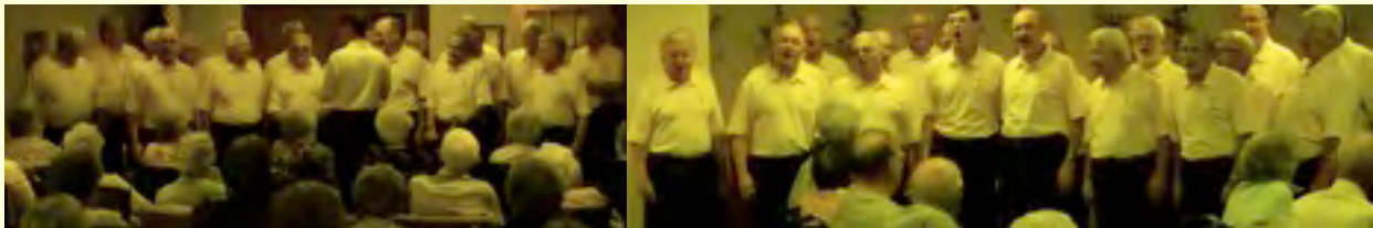
Performing at Oak Terrace and Pathstone