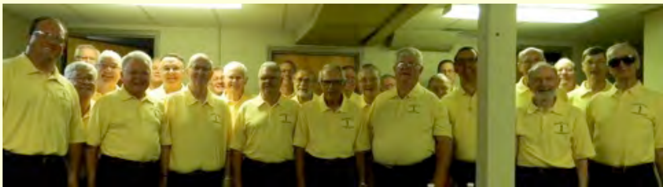
July 2 - Celebration of Our Nation - Performers