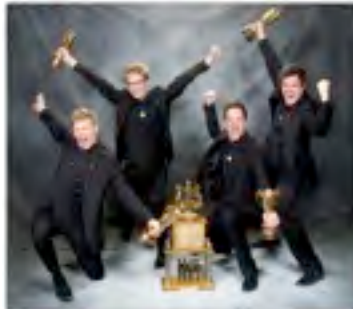
1st Place Quartet - Ringmasters-SNOBBS

1st Place - Ambassadors of Harmony - St. Charles, Missouri Pictures - Barbershop Harmony Society