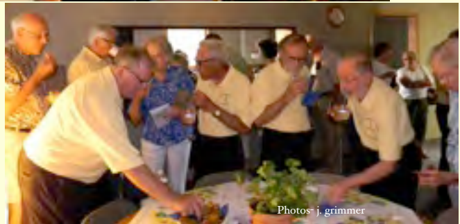
Outside signage and everyone enjoying a beverage and treats after the performance