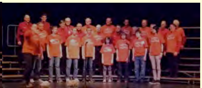
Young Men In Harmony Chorus