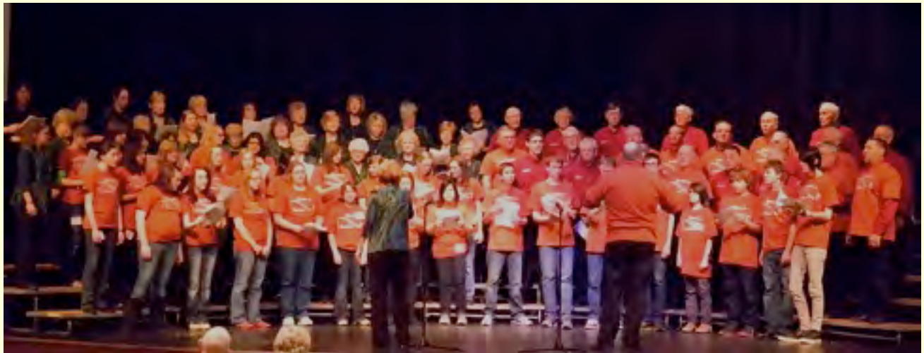
The 2013 Youth In Harmony Combined Chorus