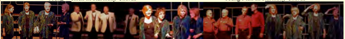
Sunny Side Up