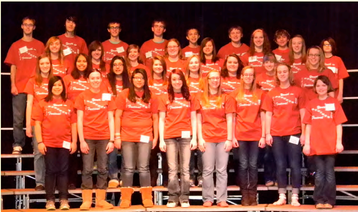
The 2013 Youth In Harmony Boys & Girls Chorus

"This activity is made possible by the voters of Minnesota through a grant from the Prairie Lakes Regional Arts Council, thanks to a legislative appropriation from the Arts and Cultural Heritage Fund"