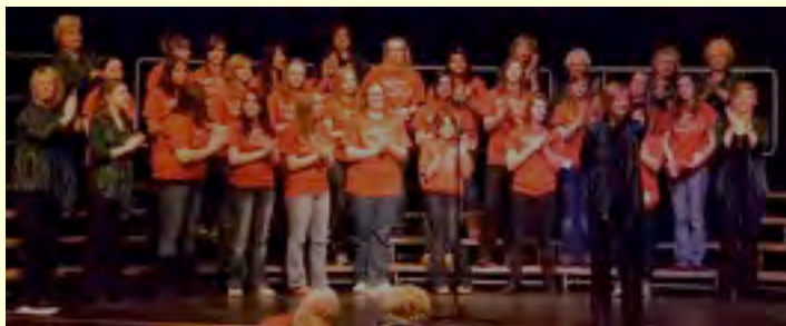
Young Women In Harmony Chorus