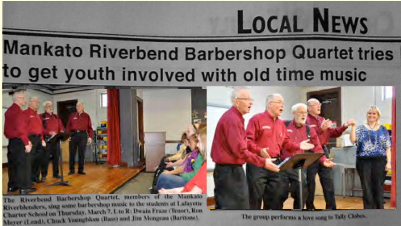
The "Lafayette Ledger" published these pictures on the front page of Local News