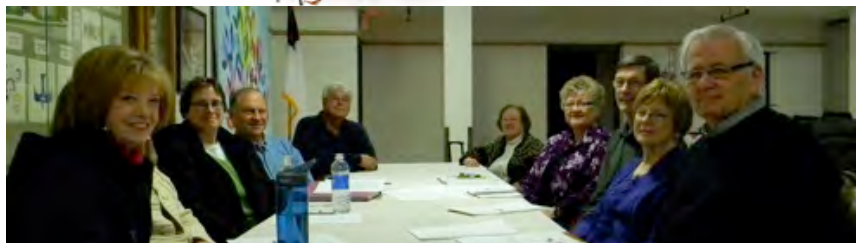
Christmas Show Planning Committee Meeting