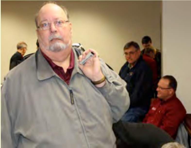
Is it really only 7:45 AM?