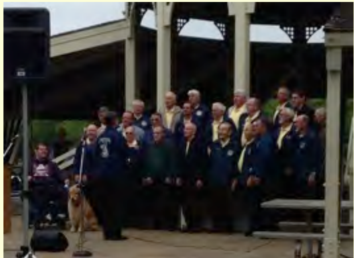
This may be the only photo of our performance at St. Peter on Memorial Day. Thanks to everyone that attended!!